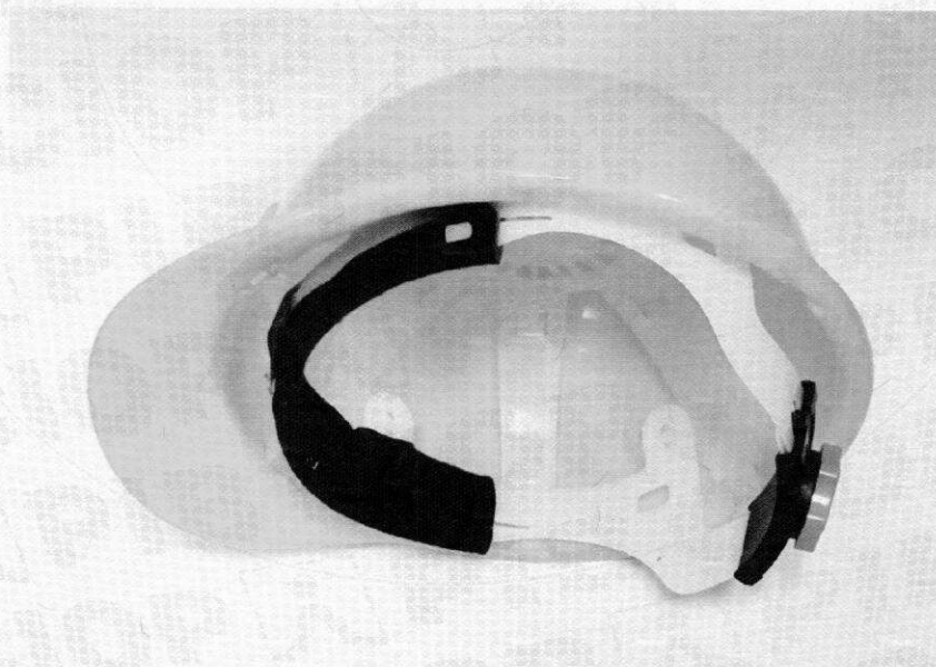
code KB 580 (adjustable screw)